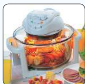
Secura Turbo Oven 777MH & 798DH